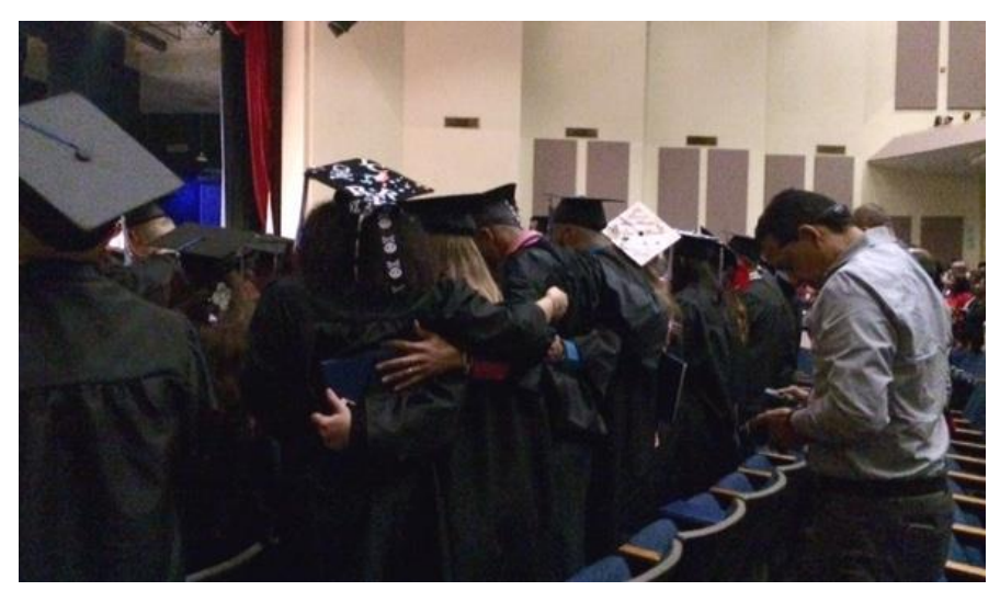
Graduates during invocation at commencement ceremony.