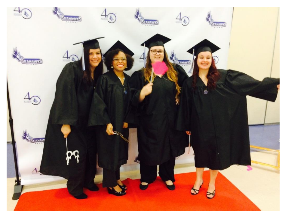
Graduates posing for pictures prior to the ceremony.