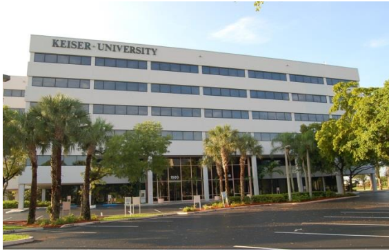
Keiser University main campus – Ft. Lauderdale, FL