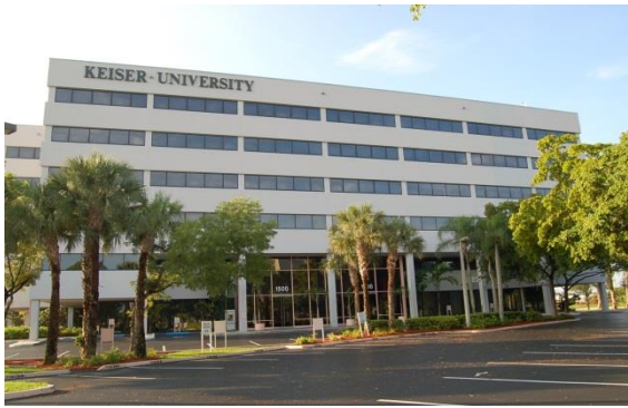
Keiser University main campus – Ft. Lauderdale, FL