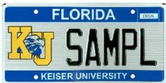
Sample of a Keiser University License Plate